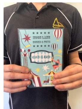
Students with their prizes in the TRACK Excellence raffle.

This week's prize is vouchers for local book store Tales on Moon Lane .